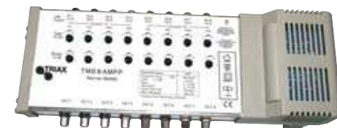
TMS 8 AMPP