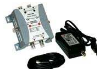
TMS 2 AMP